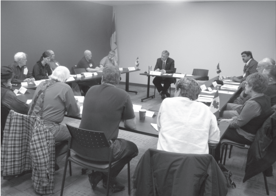
If you are interested in attending a constituent roundtable meeting, please contact the Constituency Office at 780-495-2149.