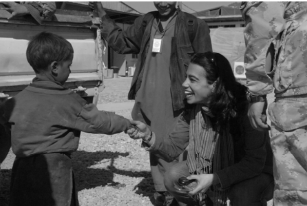
The Provincial Reconstruction Team conducts mine-awareness training in Kandahar.

Prime Minister Harper followed up his APEC statement by taking his message to the United Nations on September 24 th . There, he called on UN members to build on the dynamic created by the G8 and APEC summits to promote international cooperation in the fight against global warming. “There is an emerging consensus on the need for a new, effective and flexible climate change framework,” said the Prime Minister, “one that commits all the world’s major emitters to real targets and concrete action against global greenhouse gas emissions.”