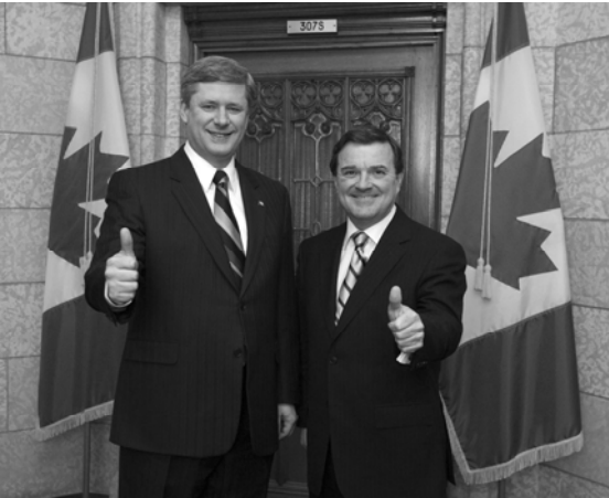
Prime Minister Stephen Harper and Finance Minister Jim Flaherty give the thumbs up to a budget that invests in Canadians

Since January 23, 2006, Canadian families and taxpayers have seen strong fiscal management from Canada's new government. We have focused on the priorities of Canadians by significantly reducing both the tax burden and the national debt, protecting the environment, helping farmers and farm families, making an historic investment in infrastructure, enhancing public health care, investing in education and training and supporting the brave men and women who keep our communities and our country safe.