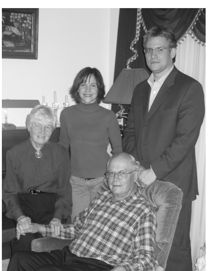
Mike Lake, Member of Parliament Edmonton - Mill Woods - Beaumont