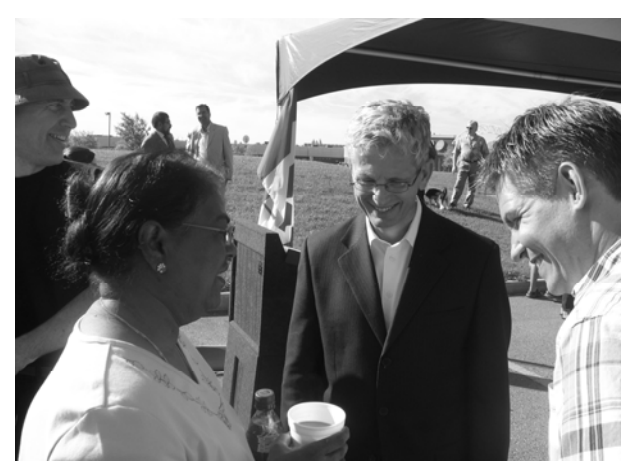
August: Meeting and greeting constituents at our 1st Annual Pancake Breakfast, with special guest, the Minister of Citizenship and Immigration, Hon. Monte Solberg