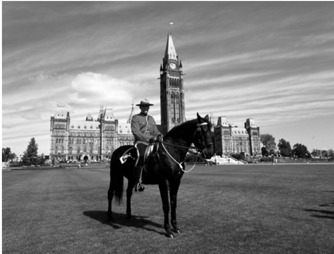
In late August, Prime Minister Harper announced an upgrade to the RCMP training academy and the hiring of 1,000 new RCMP personnel.

Security at home, on our streets, in our communities and abroad, is an issue that impacts all Canadians. Through new spending and new legislation, the new Conservative Government is making the security of Canadians a priority. This priority was made clear early in Parliament’s first session through measures such as the introduction of legislation to raise the Age of Consent from 14 to 16 to protect our children from adult predators; the introduction of a new Criminal Code offence for street racing; and an emphasis upon lengthening and toughening sentences to keep violent criminals & repeat offenders off our streets.